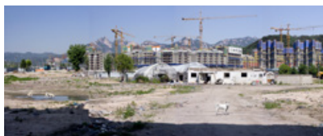
Eunpyeong New Town - White Dogs 2009, digital pigment print, 90 × 220 cm