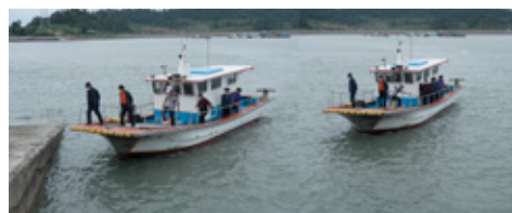
Eouido 1 - 016 2021, digital pigment print, 100 × 240 cm