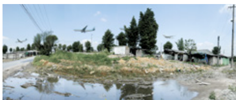
Landscape of Osoe-ri 6 2004, digital pigment print, 100 × 261 cm